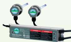
UVC-24V UVC-41W-S UVC-41W-D

Powerful ultraviolet energy helps eliminate biological contaminants such as mold and bacteria